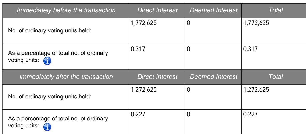
Table 1. Change in respect of ordinary voting units of Listed Issuer